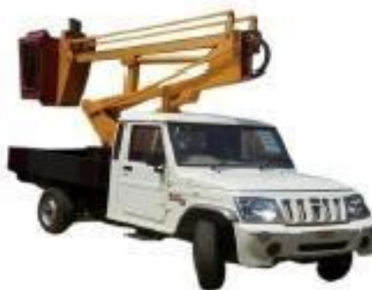
CHV with Hydraulic Lift