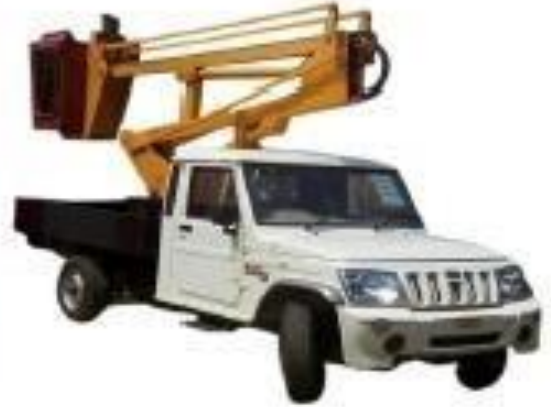
CHV with Hydraulic Lift